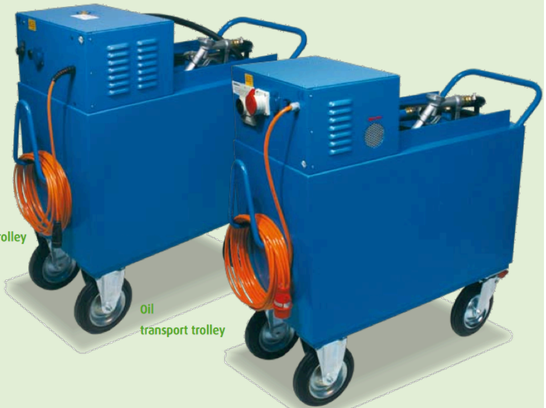
Oil transport trolley